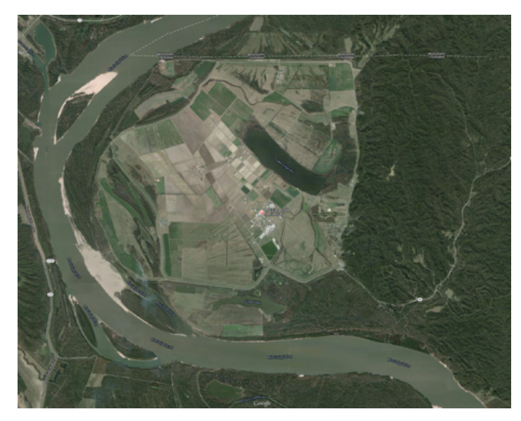
Figure 2. Map of Angola.

The recurring instances of flooding at Angola rarely led to riots or evacuation, but they nonetheless revealed much about the structure and perceived value of a life lived there. In the 1912 flood, one of the main levees protecting the prison broke, inundating "the convict plantation" and the surrounding lands.